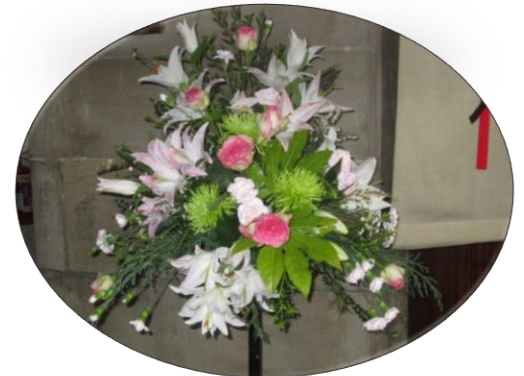
Flowers in church in loving memory of Thelma